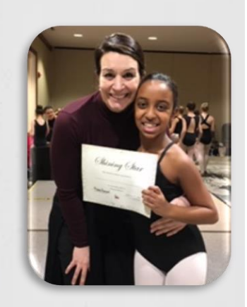
~ Ballet 7-11 ~